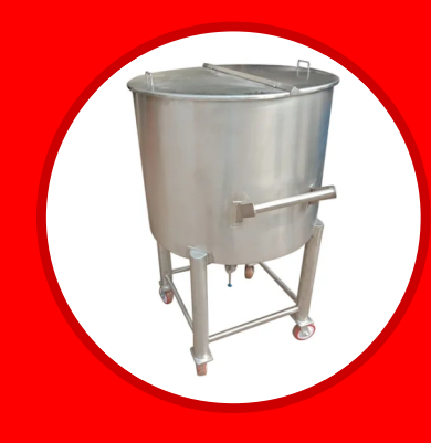
Stainless Steel Storage Container