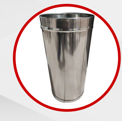
Ice Cream Kothi