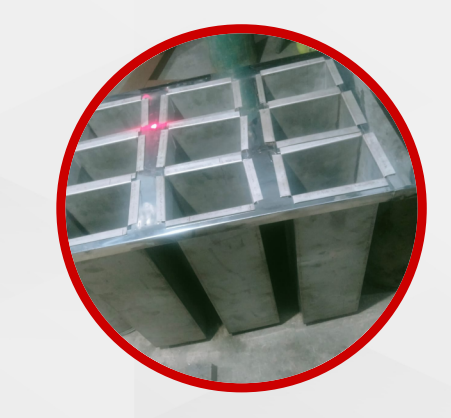
pharmaceutical storage tank