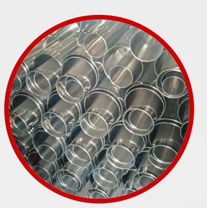
Kothi Ice Cream (5 to 50 Ltr.)