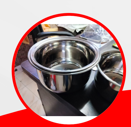
stainless steel utensils