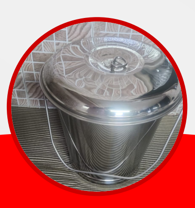
Stainless Steel Bucket