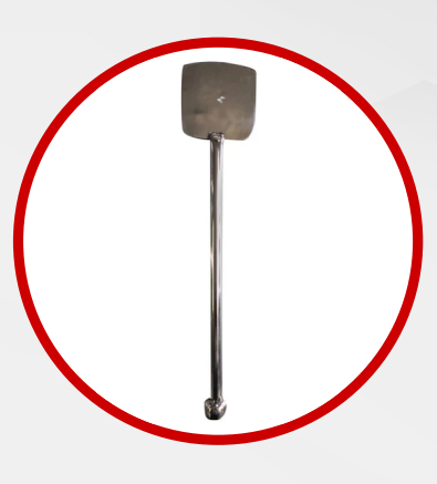
Stainless Steel Spatula