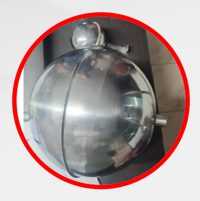
Hallow ball valve