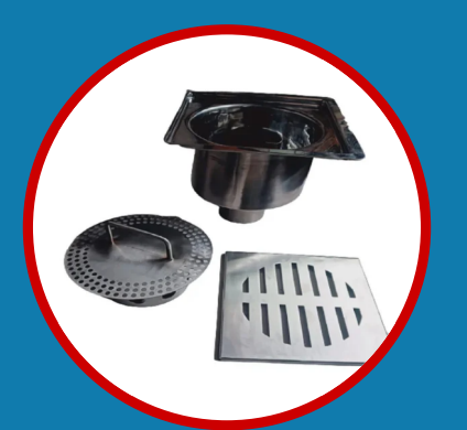
Amul Trap In Ss