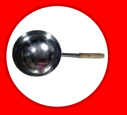
Silver Stainless Steel Ladle