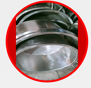
stainless steel utensils Big top