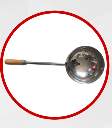
Stainless Steel Ladle