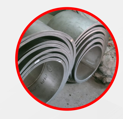
stainless steel utensils Big top