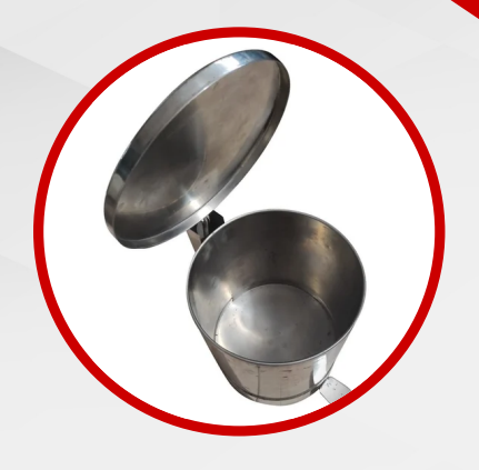
Ss Bin And Dustbin