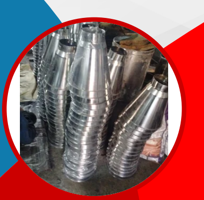
Agarbatti Machine Cone Hopper