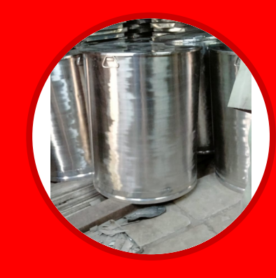
pharmaceutical storage tank