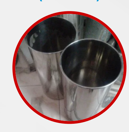
10l To 20l Ice Cream Pavali