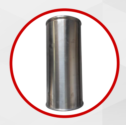
Stainless Steel Ice Cream Container