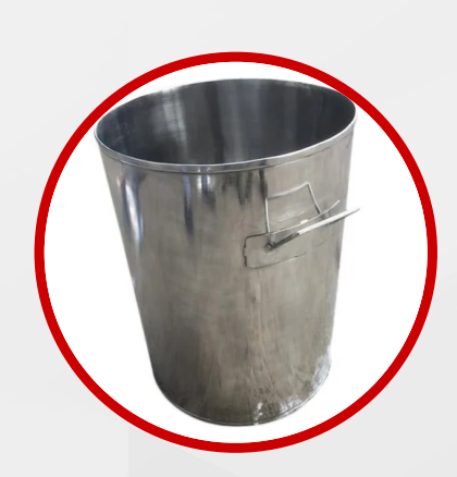
Stainless Steel Storage Container