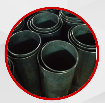
SS Milk Tank