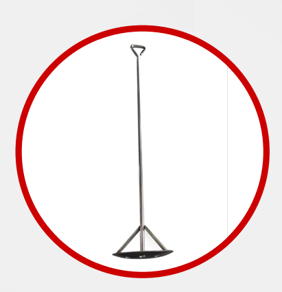
Stainless Steel Milk Plunger