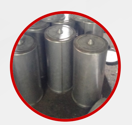
Ice Cream Kothi