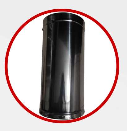
Stainless Steel Round Kothi