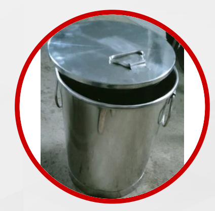
Stainless Steel Milk Container