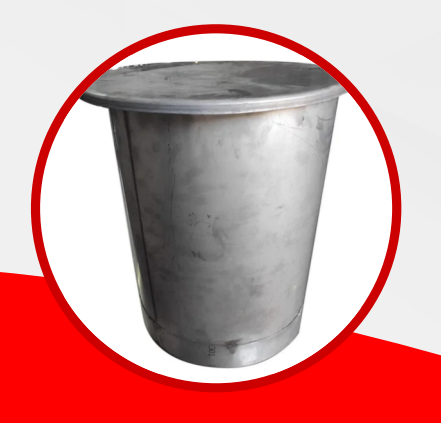
Stainless Steel Storage Container