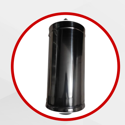
Stainless Steel Icecreem Pawali